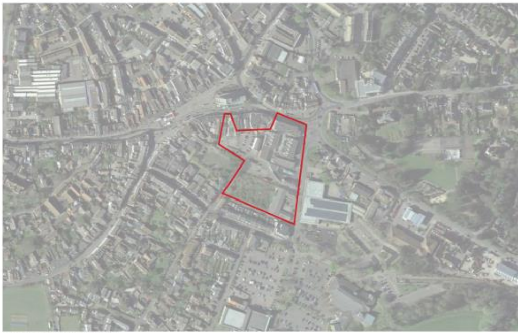
Aerial view of the site as existing

Draft Masterplan Concept Development by KLH Architects (June 2022)