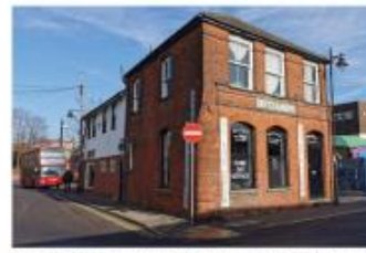
Locally listed - "should be preserved as a good example of a late Victorian commercial office"