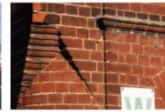
Unique oval corbeling detail