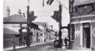
Historic photograph of the Great Eastern Road corner block