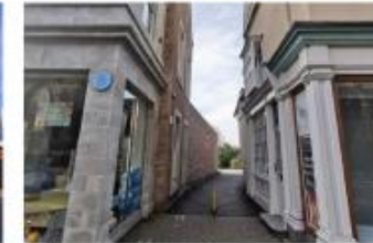
Existing block penetration