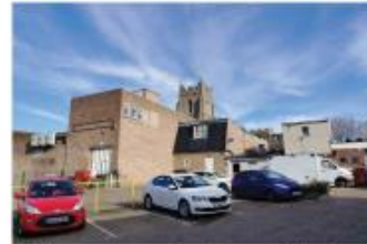
Existing service and parking use of the site