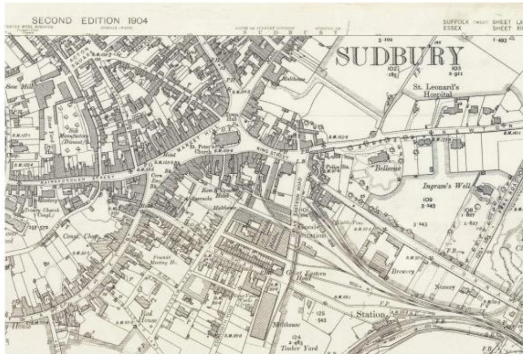
Historic 1904 map showing original building uses on brownfield site