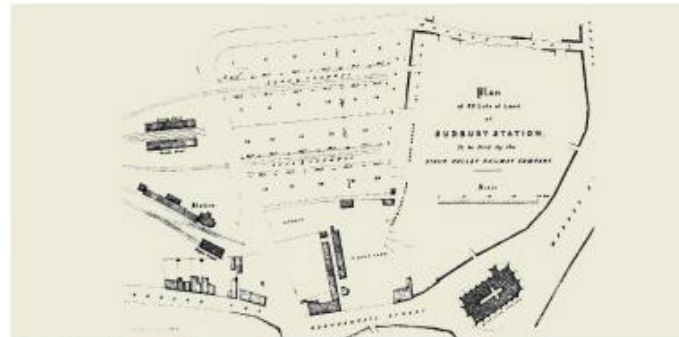
Map of plot sale circa 1849