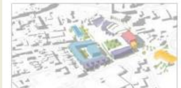
Aerial development massing sketches; existing, previous and proposed