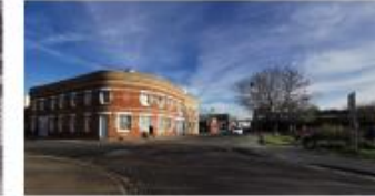
Fascadism of newly converted Great Eastern Road corner block