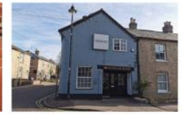
A repeat of the oval corbeling detail found on an adjacent restaurant