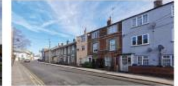
Established development grain and 3 storey scale terrace